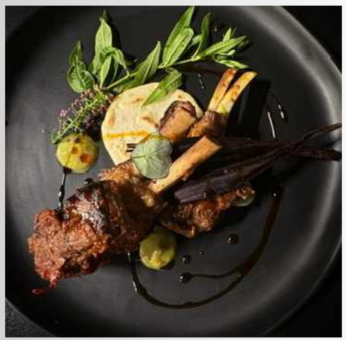
FULL SERVICE MENUS & WEDDING PACKAGES SPRING 2025